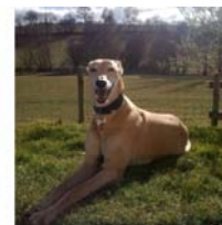
Before; Brin in the garden