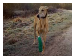
After chasing a rabbit: Three breaks in his toe.