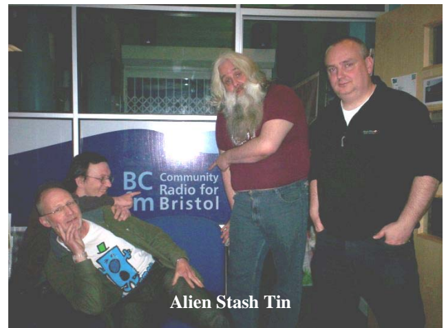
Alien Stash Tin

Tune in every Sunday, 10pm for more great music from Bristol and beyond.