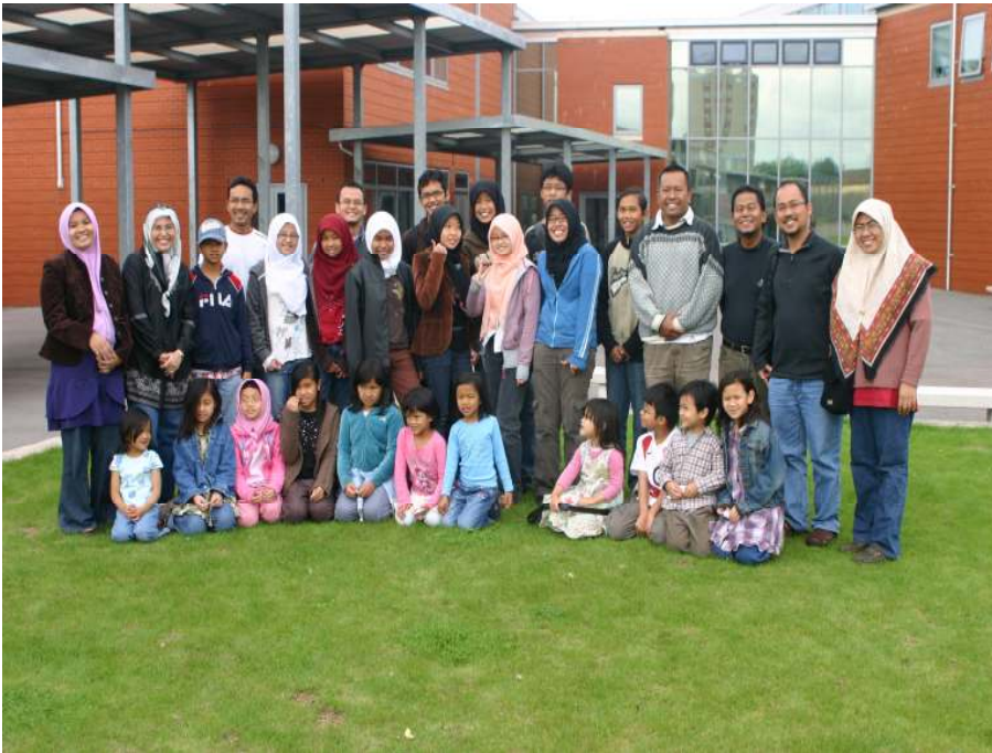
Images from BCfm's recent Ramadhan programming.