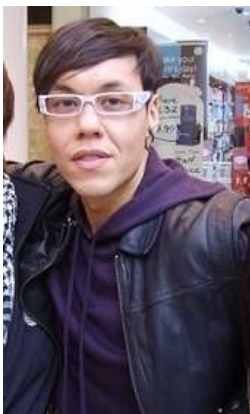
Gok Wan: Soon to appear in HJarvey Nics?