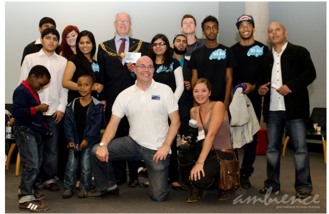
The Lord Mayor poses with the BCfm team