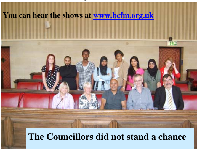
The Councillors did not stand a chance

You can hear the shows at www.bcfm.org.uk