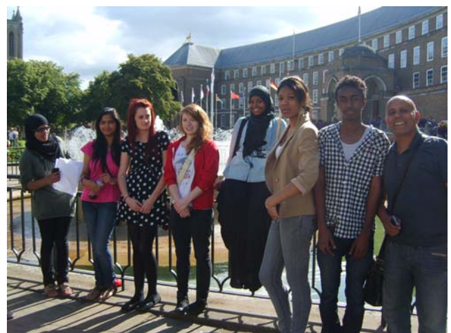
Outside the Council House waiting to take on the Council

Culture Mash can be heard on BCfm at 4pm every Tuesday